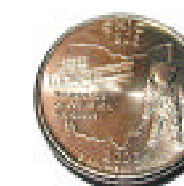
Shown actual size with quarter (when printed at full 13" x 19")